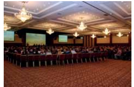
Opening ceremony of the RSP Congress.

WPA Zonal Representative for Zone 10 (Eastern Europe)