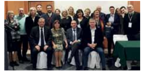
PABH General Assembly.

Our Symposium was co-organized by Department of Psychiatry, University Clinical Centre Sarajevo and supported by Medical Chamber of Sarajevo County who provided CME points for the Symposium. Course participants received specially designed