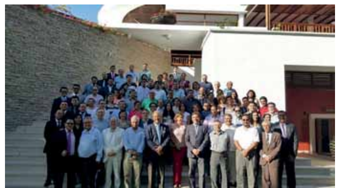
A psychiatrist meeting celebrated in Mompiche on October 29th, 2015.

On September 11 to 13 we supported a Neuro psychopharmacology Event in La Mirage - Cotacachi with special guests, on October 3 we had the Second Annual Sportive Meeting with our associates and their families for social integration, and on October 28 to 30 we had the II Meeting of