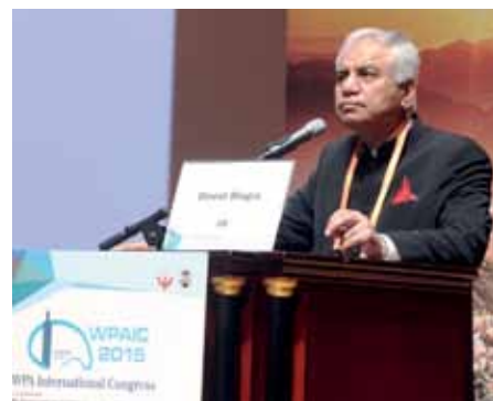
WPA President Dinesh Bhugra addressing the Congress.

2,149 participants from more than 55 countries attended this Congress. The excellent scientific program consisted of 9 Keynote Lectures; 12 State of the Art Lectures; 8 Special Lectures; 107 Main Sessions; 3 Satellite Symposia, and 502 poster presentations with the involvement from all over the world.