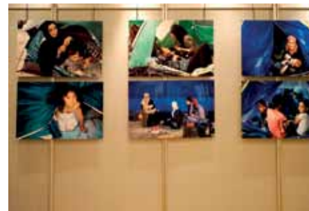
From the photographic exhibition of refugees (Dimitra Stasinopoulou).

The Section on Preventive Psychiatry of the WPA played a cardinal role in the congress.