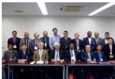
At the WPA Regional Congress, Osaka, June 2015.

Our Section has been very active and organized workshop/symposium in many international meetings. At the 5th World Congress of Asian Psychiatry (WCAP) which was co-sponsored by the WPA, the Section organized a workshop